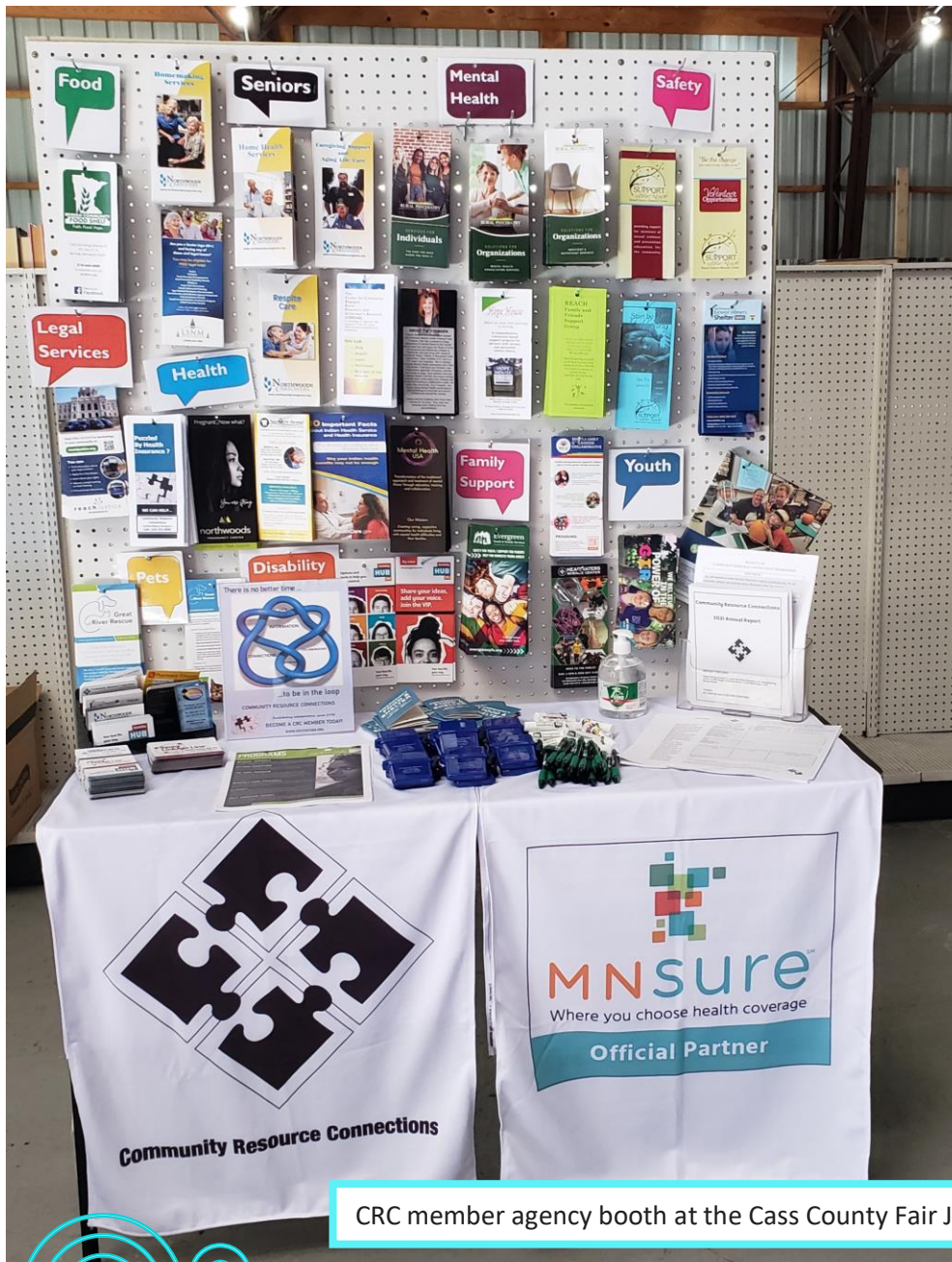
CRC member agency booth at the Cass County Fair July 2022

We want to include your agency information at our booth just like we did at the Cass County Fair.